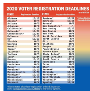
State Registration Deadlines

Deadlines to Register in Week 4: Oct 19 - Oct 25